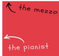
↑ the mezzo ← the pianist

COMBINING THE BEST OF ALL POSSIBLE WORLDS - AWESOME SINGING, GREAT-SOUNDING ORCHESTRA, RIVETING DRAMA, STUNNING DANCE, SPECTACULAR SETS, LAVISH COSTUMES, FANCY LIGHTING, AND SPECIAL EFFECTS - OPERA DELIVERS! THROUGH HUMOROUS ANECDOTES AND POP CULTURE REFERENCES, STUDENTS LEARN THAT OPERA IS A BIG PART OF THE WORLD AROUND THEM AND DISCOVER JUST HOW RELATABLE IT CAN BE