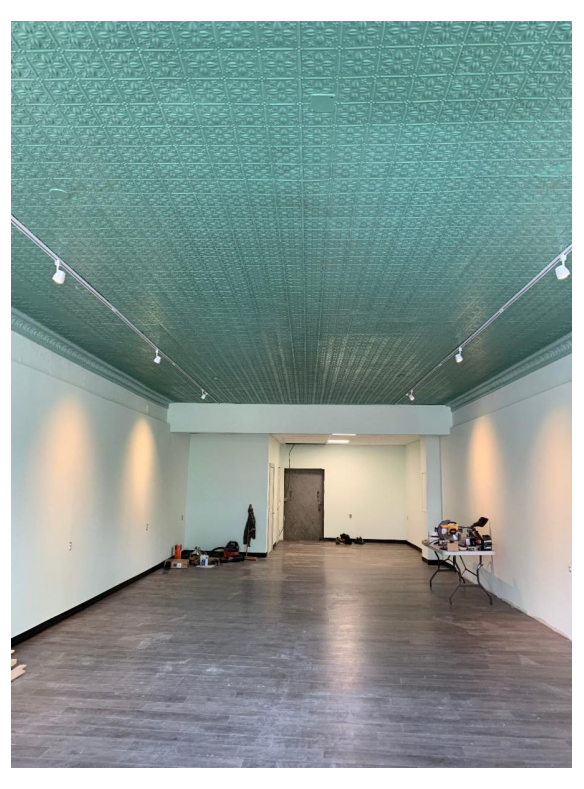
#8 Under Renovations (pictured above and to the right)

#12 Available Immediately (pictured below)