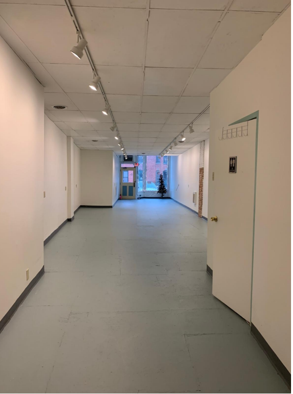
#12 Available Immediately (pictured above)

Earlville Opera House owns #12 East Main Street, a 1000 square foot Victorian storefront on the historic Douglass Block, and we are now accepting inquiries to lease this space.